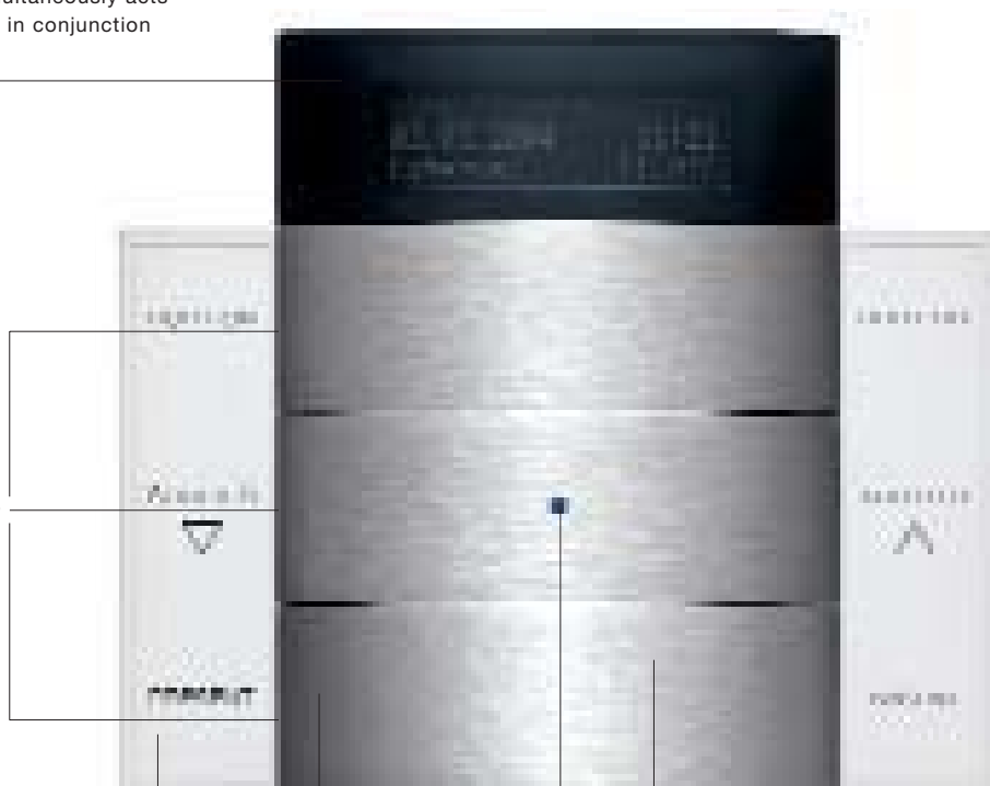
Status of LEDs

Clear text display for menu-guided program navigation or display of selected settings. Display simultaneously acts as interactive switch in conjunction with the menu